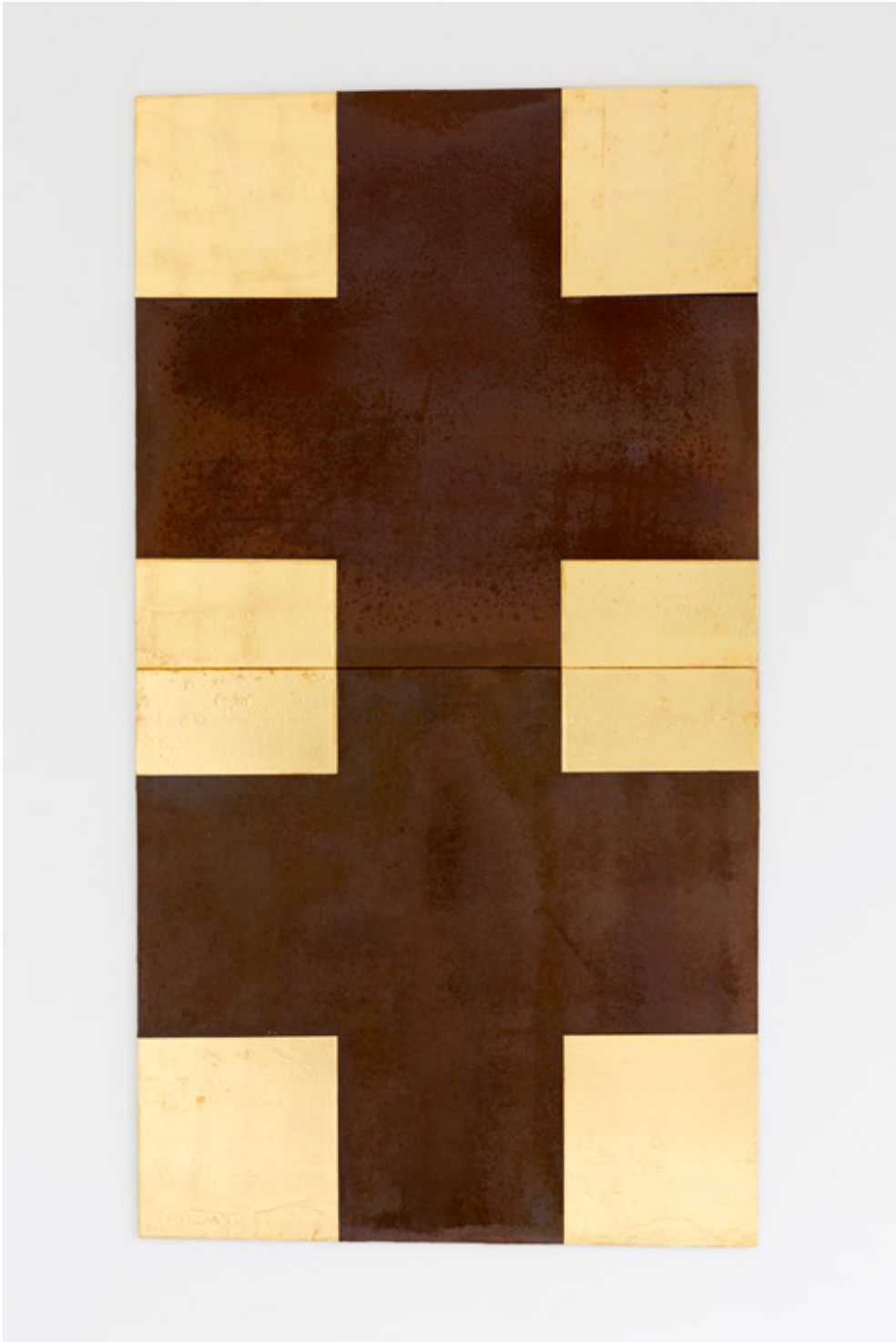
"Ideal knowledge is the eternal present" 2014 iron filings and 23k gold on 2 aluminium panels 1697 x 900 mm