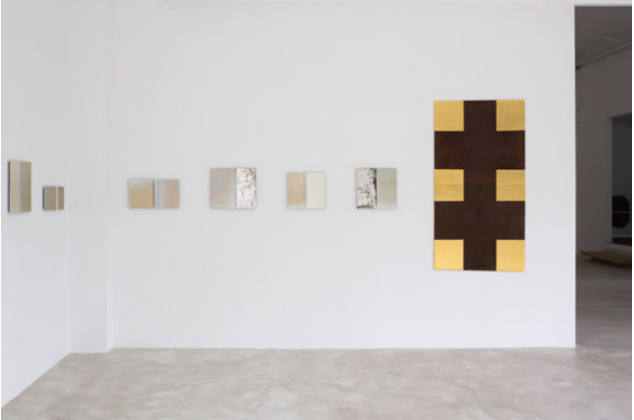
Installation view Trish Clark Gallery, 2014