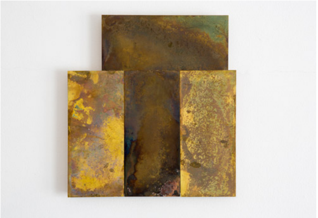
Seven Days (V) 2014 chemical action on 4 brass plates 244 x 226 mm