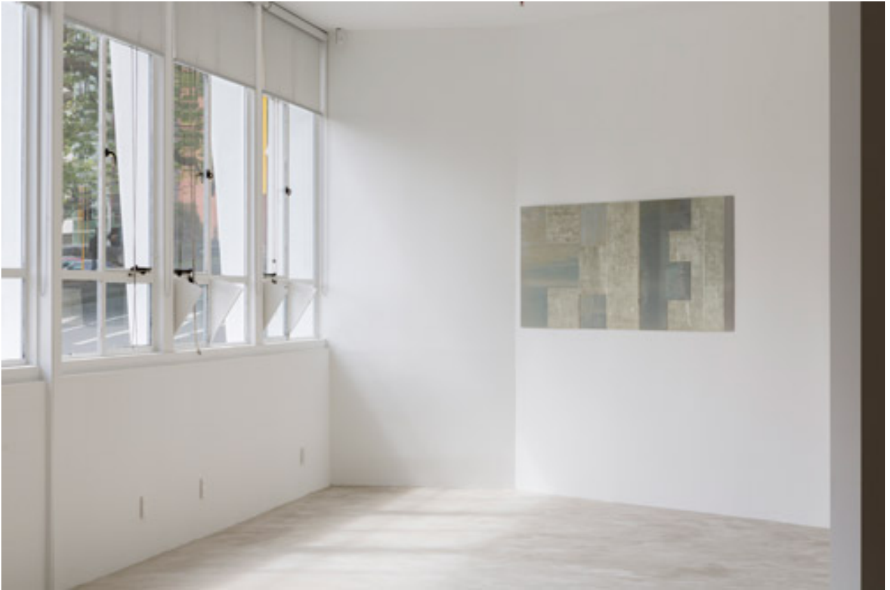
Installation view Trish Clark Gallery, 2014