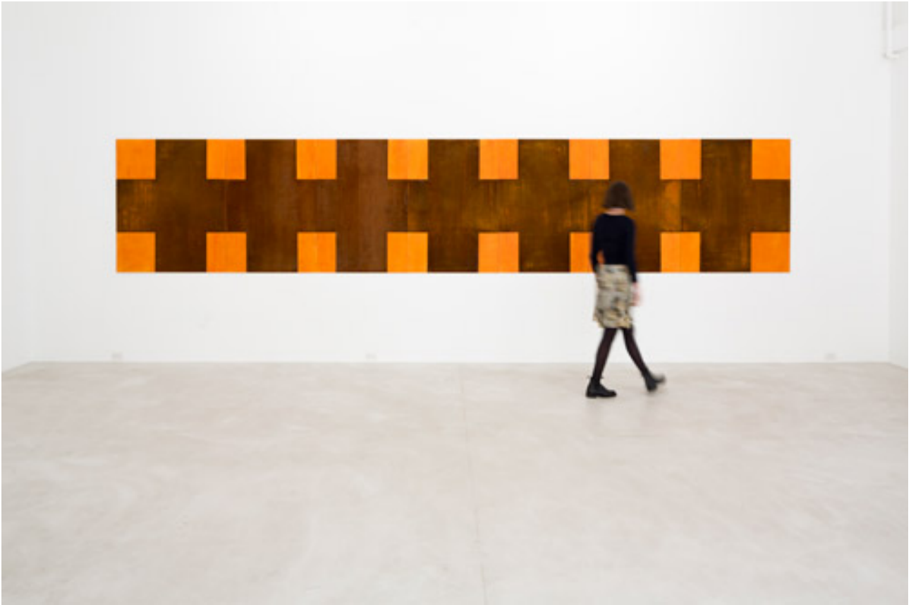
Here 2014 iron filings and acrylic on 7 aluminium panels 1400 x 7080 mm