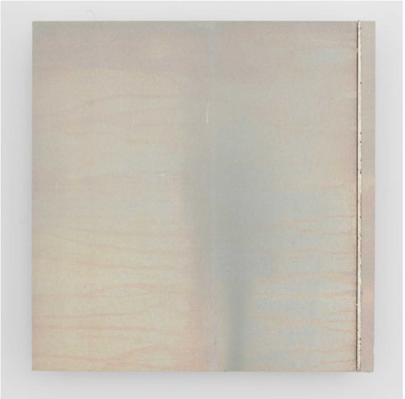
Fourteen Mirrors (XI) 2014 chemical action on aluminium, acrylic and 12k white gold 271 x 265 mm (3 panels)