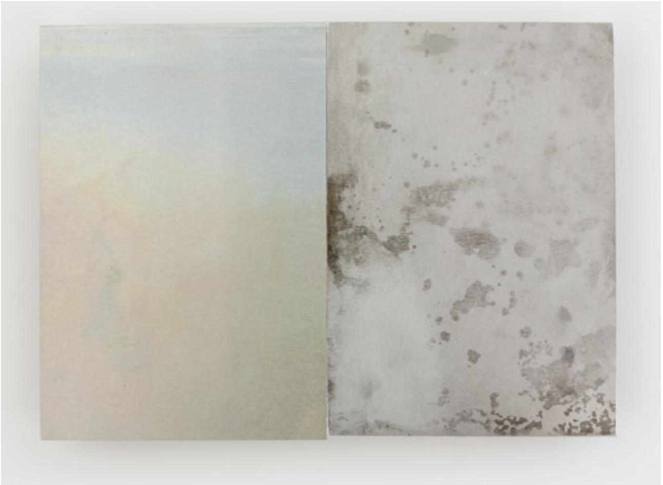
Fourteen Mirrors (X) 2014 chemical action on aluminium 169 x 233 mm (2 panels)