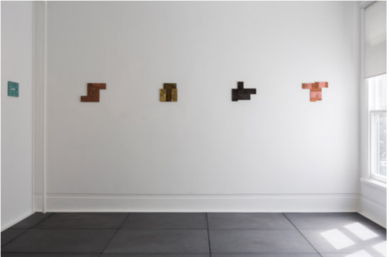
Installation view Trish Clark Gallery, 2014