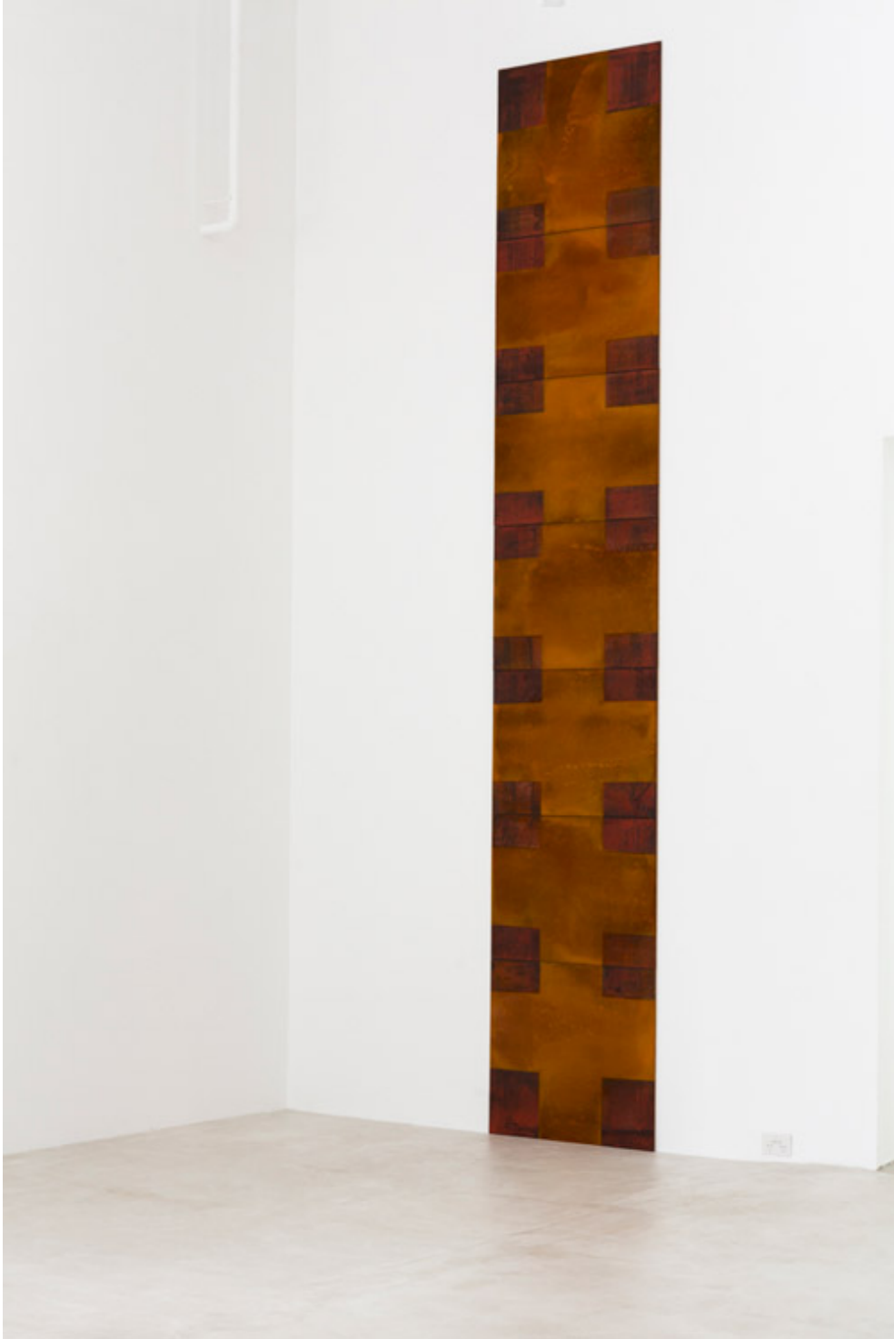
Hau 2014 iron filings and acrylic on 7 aluminium panels 4000 x 720 mm