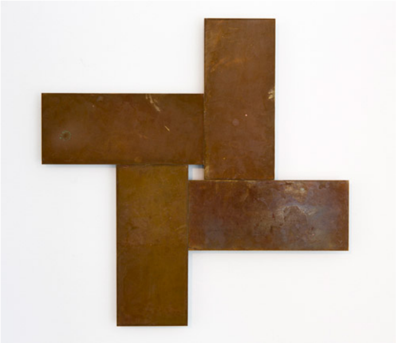
Seven Days (I) 2014 chemical action on 4 brass plates 325 x 325 mm