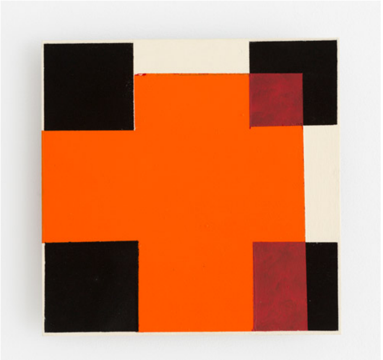
Myth 2014 acrylic on aluminium 170 x 170 mm