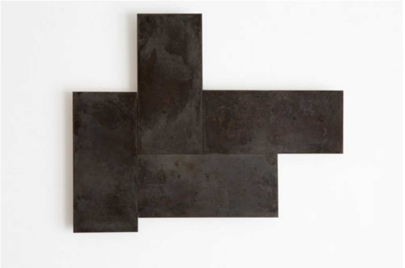
Seven Days (VI) 2014 chemical action on 4 brass plates 260 x 321 mm