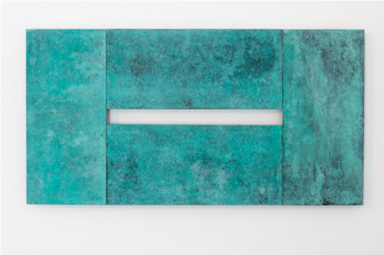
Seven Days (III) 2014 chemical action on 4 brass plates 170 x 327 mm