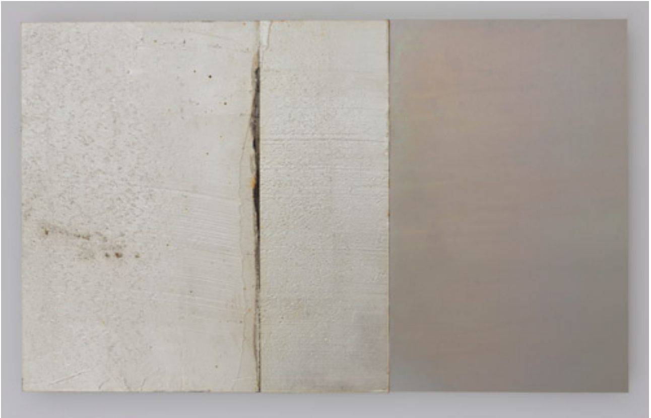
Fourteen Mirrors (III) 2014

chemical action on aluminium, acrylic and chemical action on silver and 12k white gold 390 x 641 mm (2 panels)