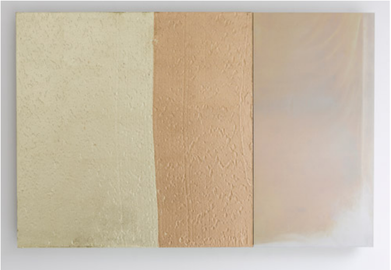
Fourteen Mirrors (XIV) 2014 chemical action on aluminium, acrylic, 16k gold and 18k gold 390 x 593 mm (3 panels)