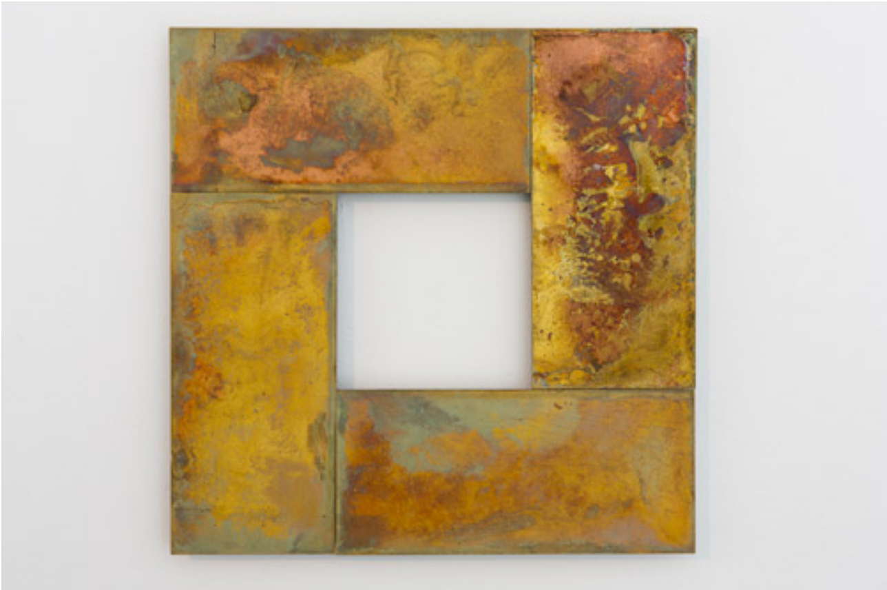
Seven Days (II) 2014 chemical action on 4 brass plates 249 x 249 mm