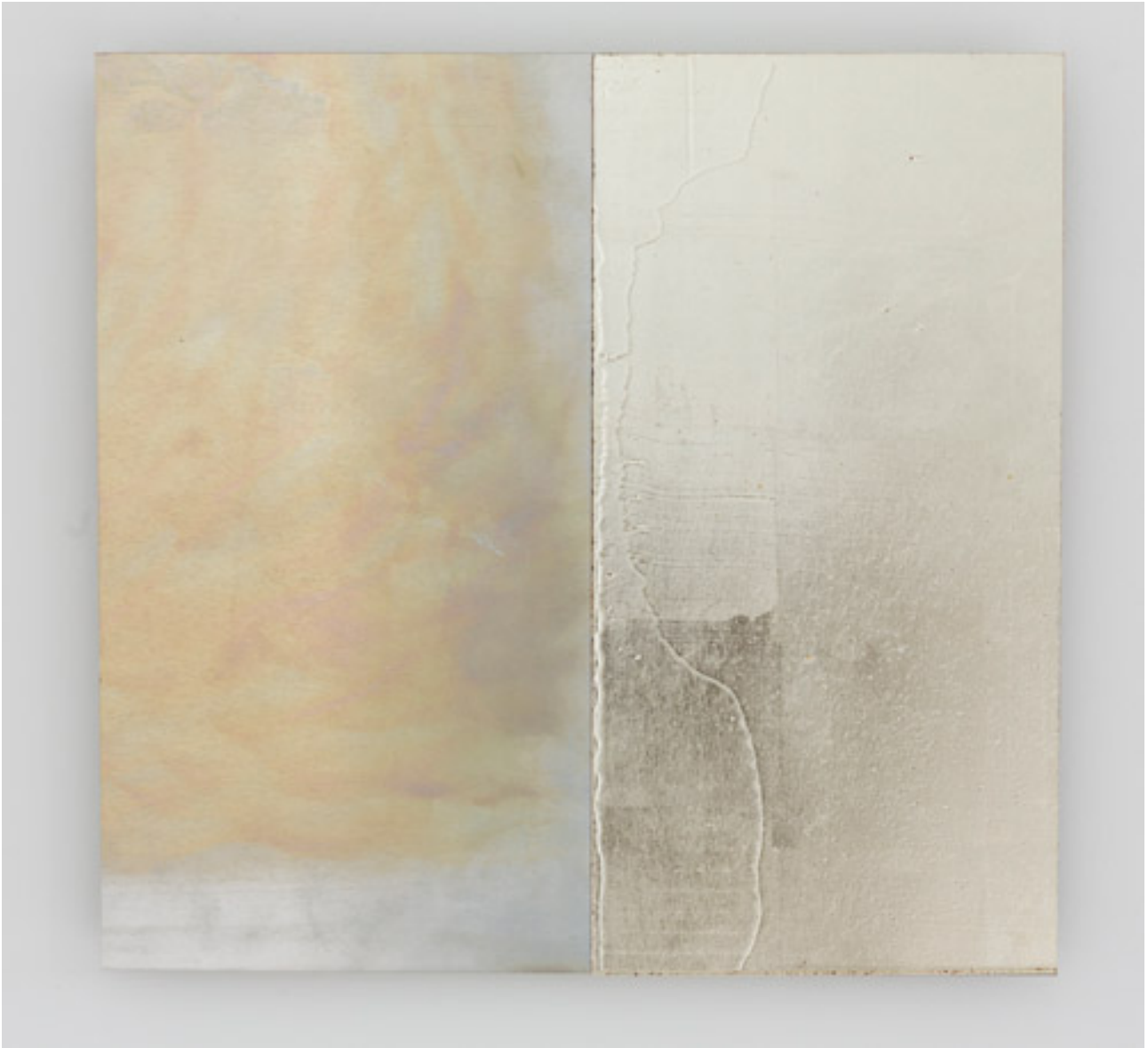
Fourteen Mirrors (VIII) 2014 chemical action on aluminium, acrylic and chemical action on 12k white gold and silver 350 x 360 mm (2 panels)