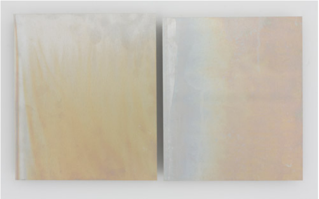
Fourteen Mirrors (VI) 2014 chemical action on aluminium L: 287 x 246 mm, R: 280 x 238 mm (2 panels - 12mm gap)