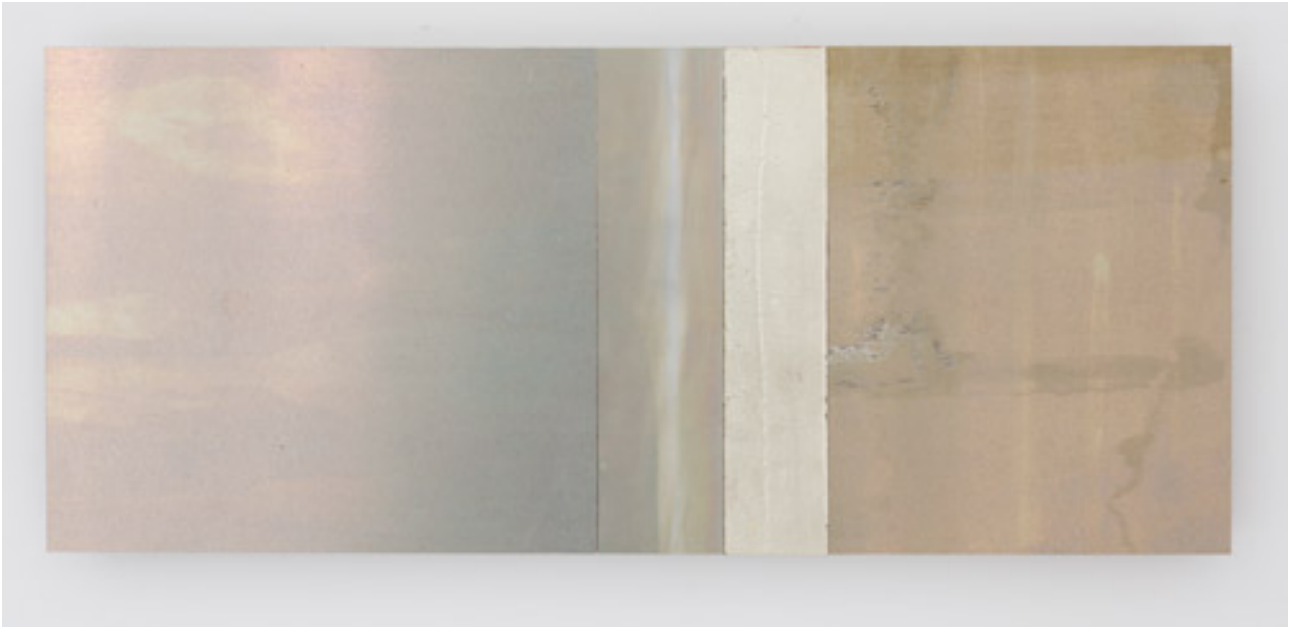
Fourteen Mirrors (V) 2014 chemical action on aluminium 205 x 483 mm (4 panels)