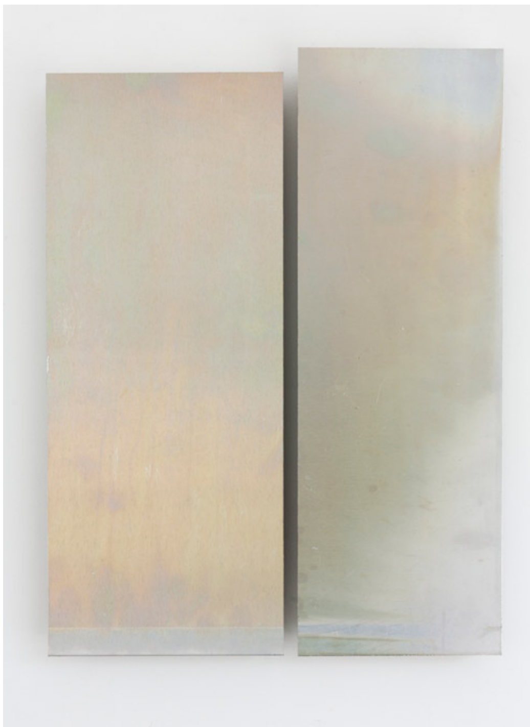
Fourteen Mirrors (XII) 2014 chemical action on aluminium, 470 x 296 mm installed (2 panels - 6mm gap)