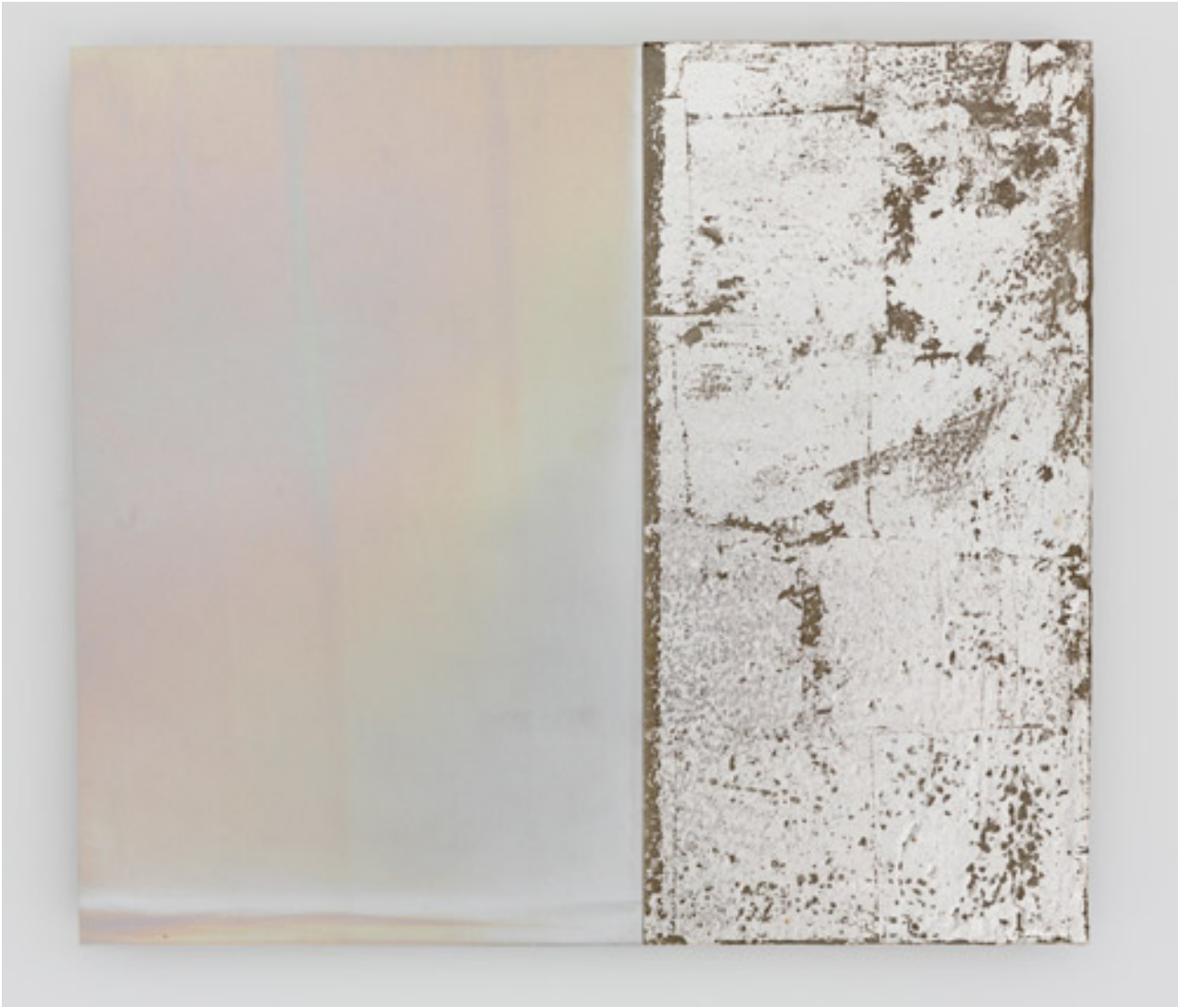
Fourteen Mirrors (VII) 2014 chemical action on aluminium, acrylic and chemical action on 12k white gold and silver 395 x 440 (2 panels)