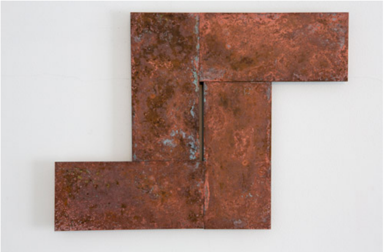
Seven Days (IV) 2014 chemical action on 4 brass plates 249 x 338 mm