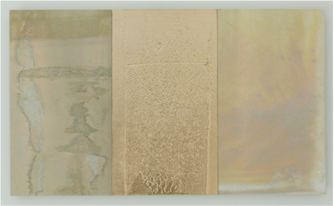
Fourteen Mirrors (I) 2014 chemical action on aluminium, acrylic and 16k gold 387 x 659 mm (3 panels)