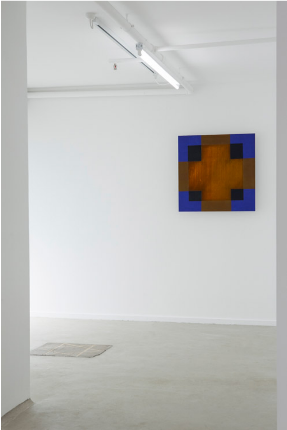
Installation view Trish Clark Gallery, 2014