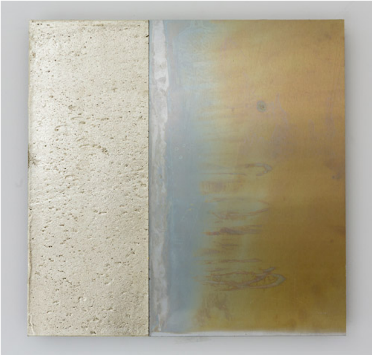
Fourteen Mirrors (IV) 2014 chemical action on aluminium, acrylic and 12k white gold 391 x 392 mm (2 panels)