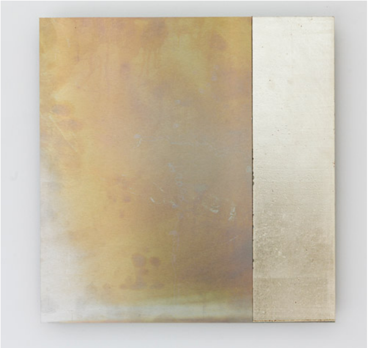
Fourteen Mirrors (II) 2014 chemical action on aluminium, acrylic and 12k white gold 347 x 333 mm (2 panels)