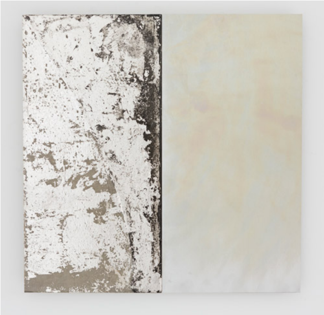
Fourteen Mirrors (IX) 2014

chemical action on aluminium and chemical action on silver and 12k white gold and acrylic 390 x 390 mm (2 panels)