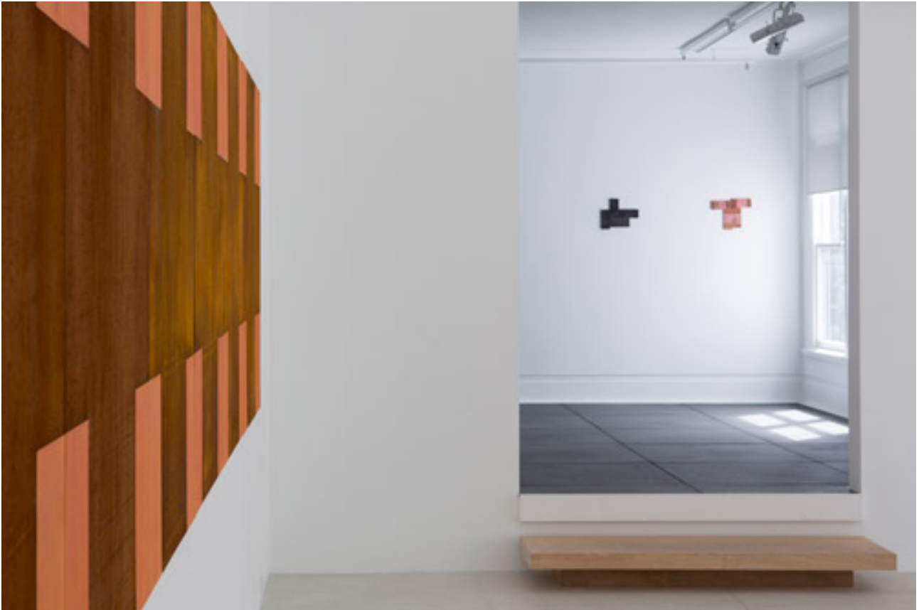
Installation view Trish Clark Gallery, 2014