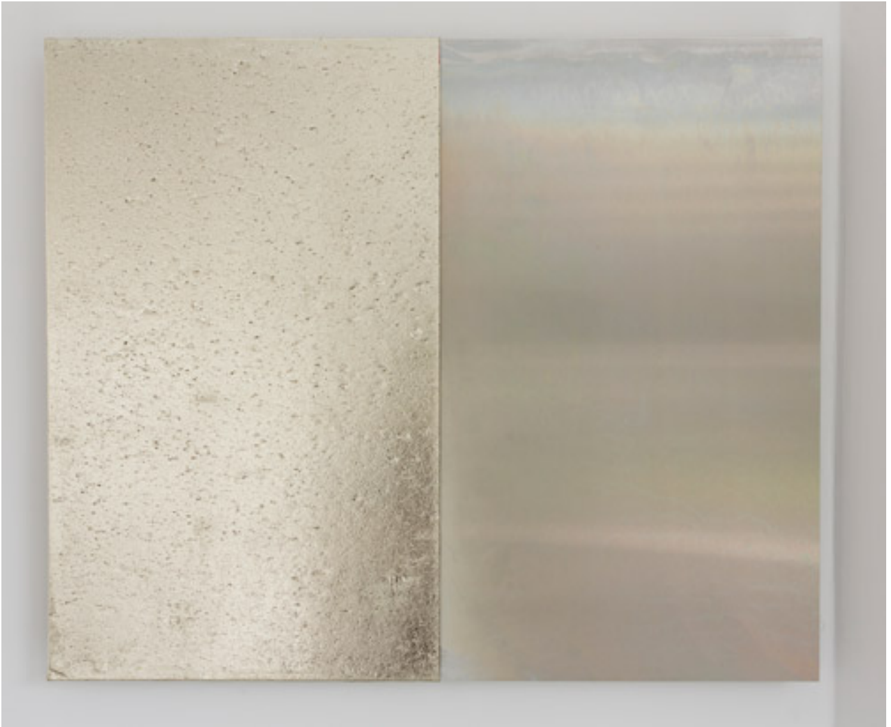
Fourteen Mirrors (XIII) 2014 chemical action on aluminium, acrylic and 12k white gold 390 x 469 mm (2 panels)