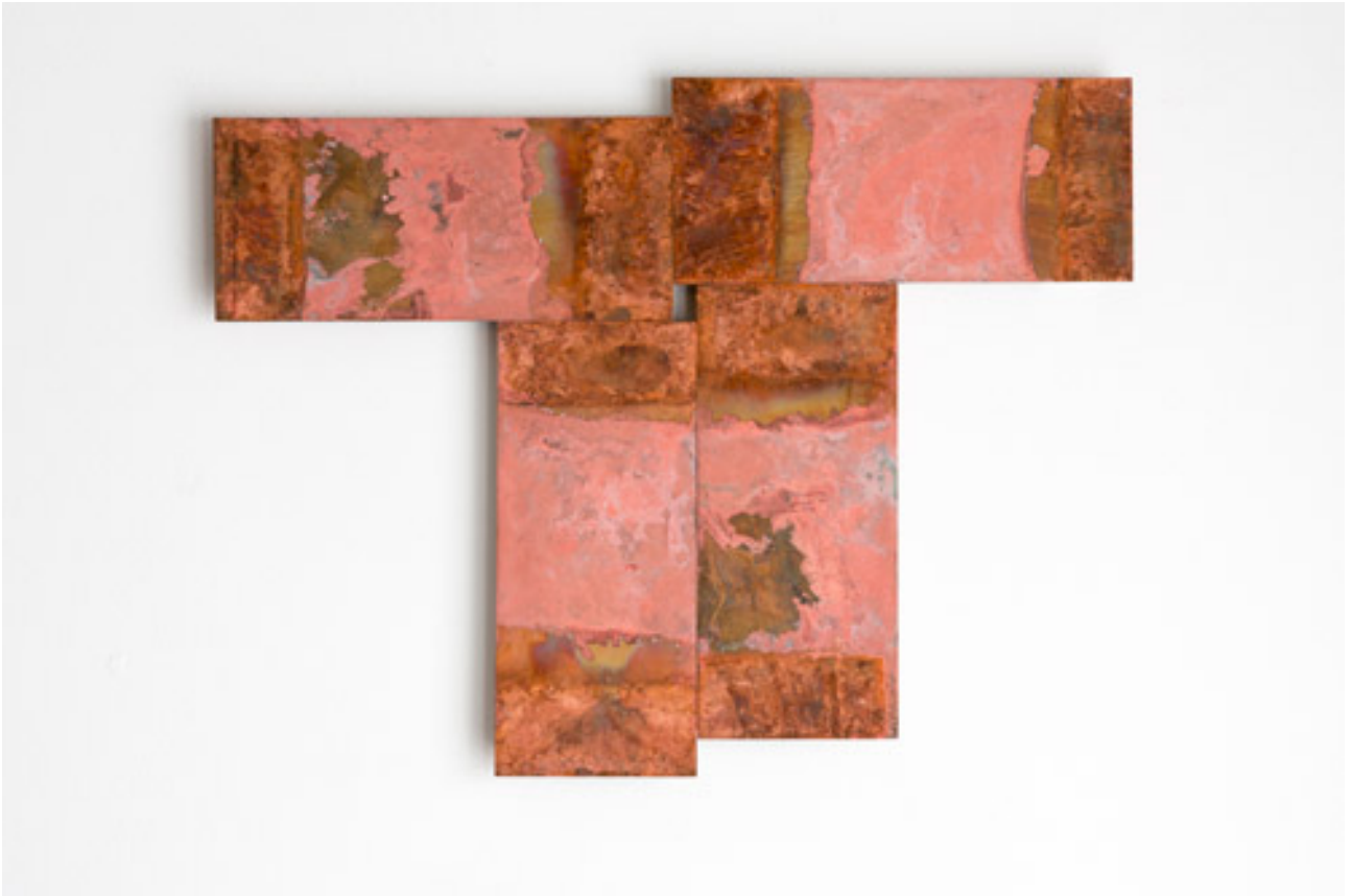
Seven Days (VII) 2014 chemical action on 4 brass plates 262 x 341 mm