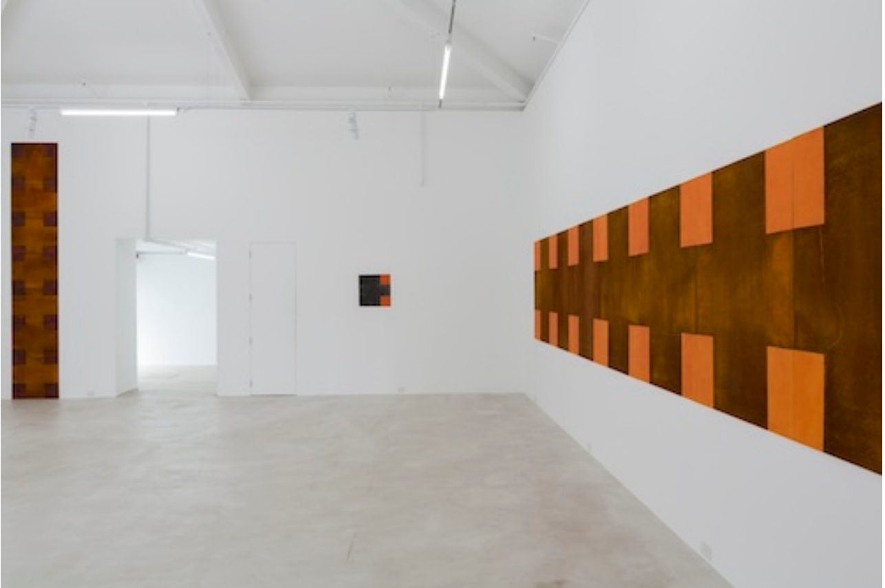
Installation view Trish Clark Gallery, 2014