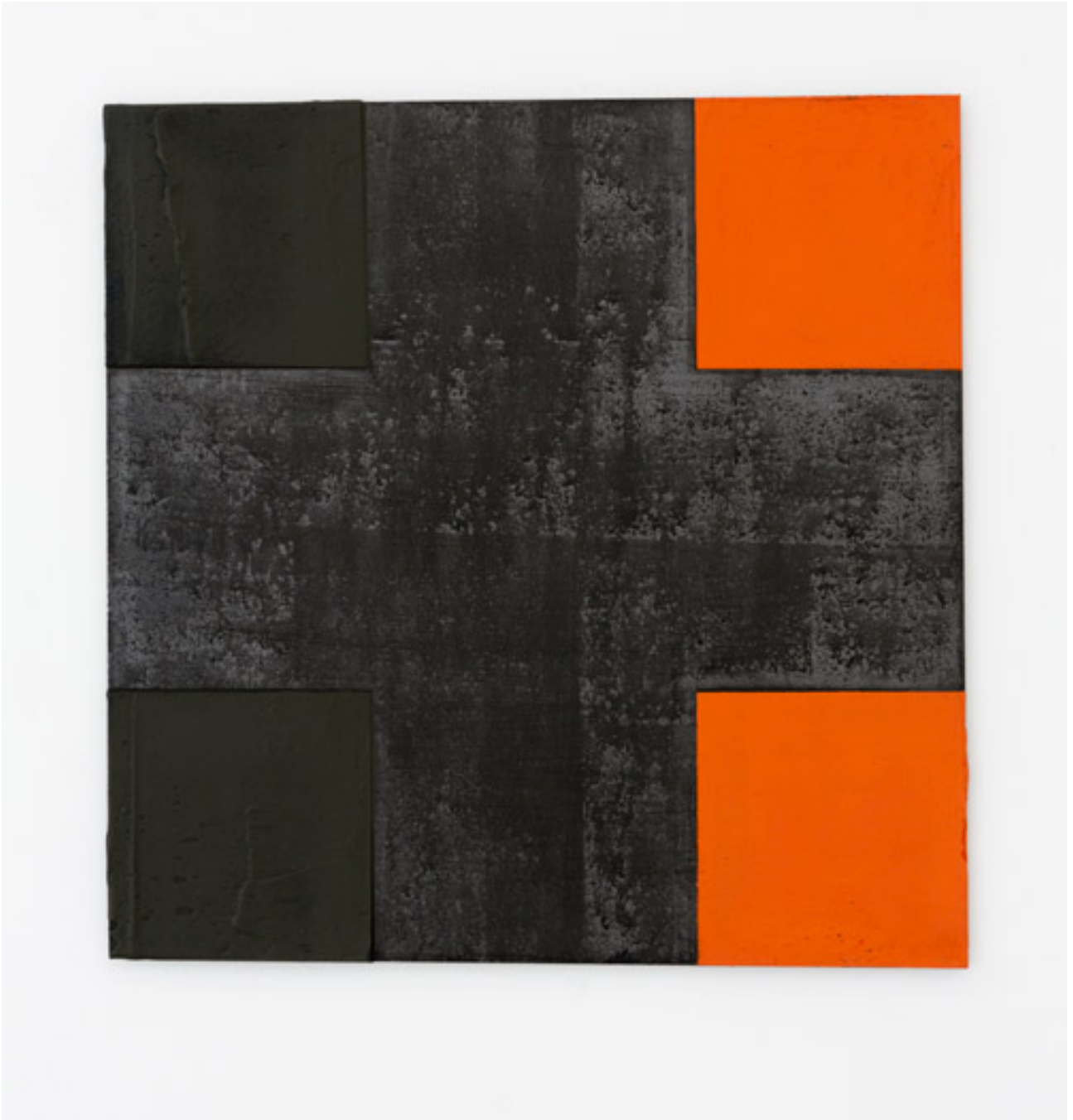
Te Ara 2014 acrylic and graphite on aluminium 510 x 499 mm