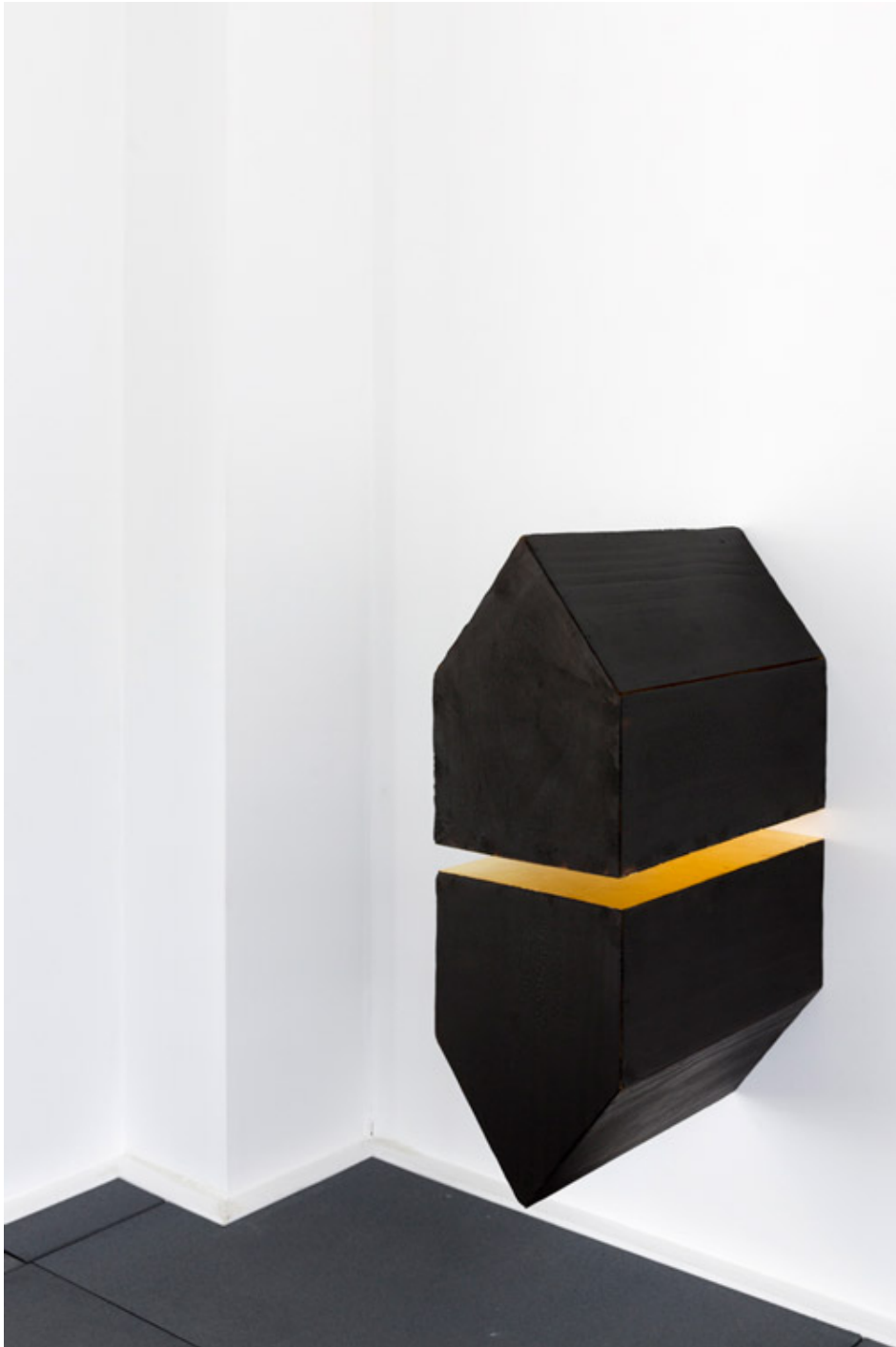
Hausen (Another Place) Slovenia 2000 charred wood and 23K gold on 2 units 790 x 270 x 490 mm Unique