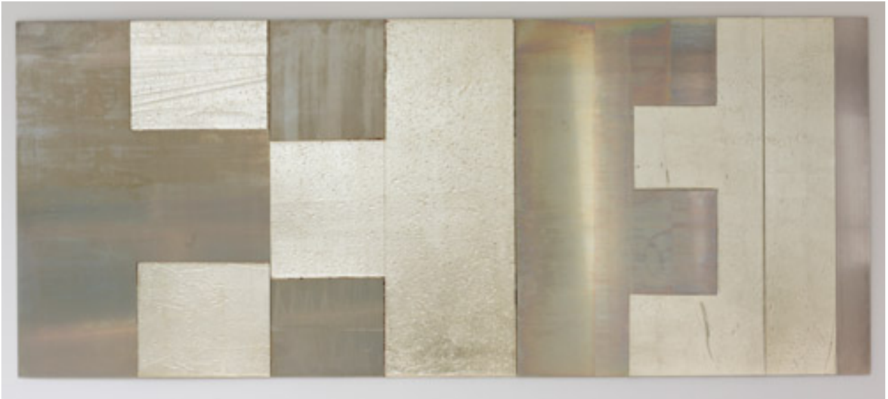
Ideogram (at Giverny) 2014 chemical action on aluminium, acrylic and white gold on 5 aluminium panels 910 x 2158 mm