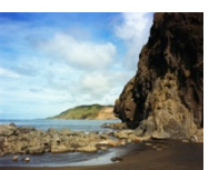
Remnants of Paratutae Wharf, Whatipu, 2015 Archival pigment print 110 x 137 cm Edition 1 of 7 $6500 (framed, museum glass)