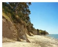
Undersea Cables, Pink Beach, Whangaparaoa, 2015 Archival pigment print 140 x 174 cm Edition 1 of 7 $8000 (framed, UV plexiglass)