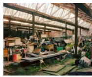
Former New Zealand Shipping Company Building, Tokomaru Bay, 2016 Archival pigment print 110 x 137 cm Edition 1 of 7 $6500 (framed, museum glass)