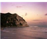
Last Light, Tokomaru Bay Wharf, 2016 Archival pigment print 140 x 174 cm Edition 1 of 7 $8000 (framed, UV plexiglass)