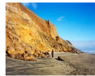
Cliffs and Rockfalls, Awhitu Peninsula, 2015 Archival pigment print 150 x 189 cm Edition 2 of 7 $8000 (framed, UV plexiglass)