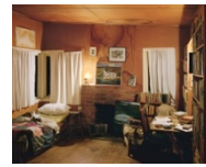
Evening, The Frank Sargeson House, Esmonde Road, Takapuna, 2015 Archival pigment print 110 x 137 Edition 1 of 7 $6500 (framed, museum glass)