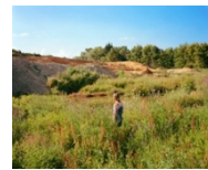
Wildflowers In A Development Near Tauranga, 2015 Archival pigment print 110 x 135 cm Edition 1 of 7 $6000 (framed, UV plexiglass)