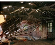
Collapsing Roof, Gisborne Sheep Shearers Woolstore, Tokomaru Bay, 2016 Archival pigment print 140 x 175 Edition 1 of 7 $8000 (framed, UV plexiglass)