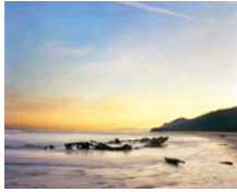
Winter Morning, Remains of the SS Lawrence, Mokihinui, 2016 archival pigment print 1200 x 1500 mm $6200 (framed, UV plexiglass)