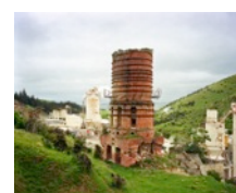
Collapsing Kiln, Makareao Limeworks, 2016 archival pigment print 1400 x 1750 mm $8000 (framed, UV plexiglass)