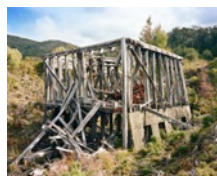
Collapsing Coal Bin, Escarpment Mine, Denniston Plateau, 2016 archival pigment print 1300 x 1650 mm $7000 (framed, UV plexiglass)