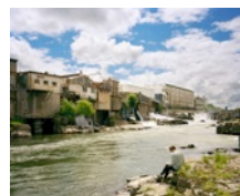
A Poet Writing Before the Falls and Freezing Works, Maitaia, 2016 archival pigment print 1400 x 1750 mm $8000 (framed, UV plexiglass)