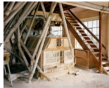
Cheadle Heath Purifier, Former Temuka Flour Mill, 2016 archival pigment print 1400 x 1750 mm $8000 (framed, UV plexiglass)