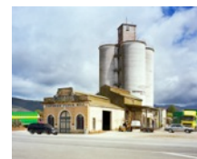
Loading Fertilizer, Former Empress Flour Mill, Waimate, 2016 archival pigment print 1400 x 1750 mm $8000 (framed, UV plexiglass)