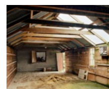
Upper Level of a Collapsing Hop Kiln, Wai-Iti, Near Nelson, 2016 archival pigment print 1200 x 1500 mm $6200 (framed, UV plexiglass)