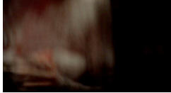
UPPER ROOM hand weaver , 2018/19 Video: 03:36 minutes Edition of 5