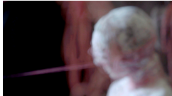
SIDE WALL inking in the black , 2018/19 Video: 05:10 minutes Edition of 5