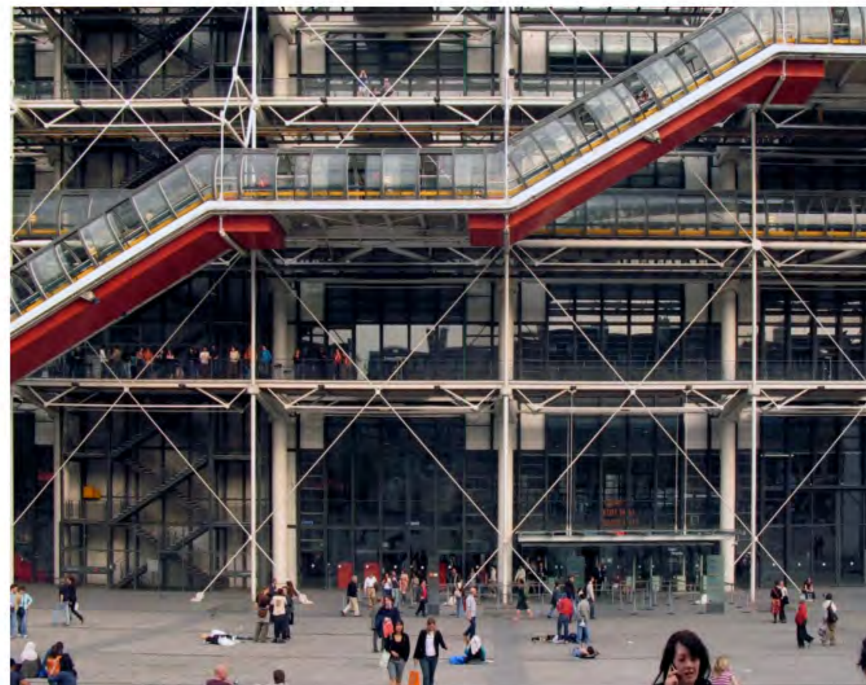
Above: Alfredo Jaar, Du Voyage, Des Gens , 2011

Video 3 min looped