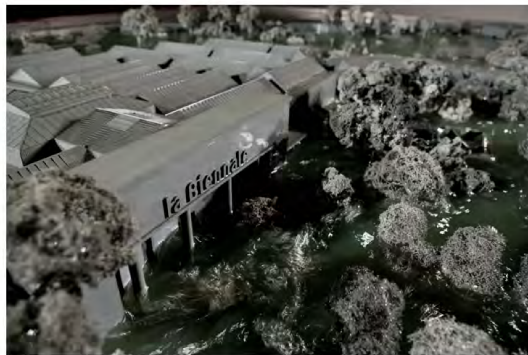
Above: Alfredo Jaar, Venezia, Venezia, 2013 Courtesy Goodman Gallery, Johannesburg/Cape Town, Galerie Lelong, New York, kamel mennour, Paris, Galería Patricia Ready, Santiago, Galleria Lia Rumma, Milano/Napoli, Galerie Thomas Schulte, Berlin and the artist, New York