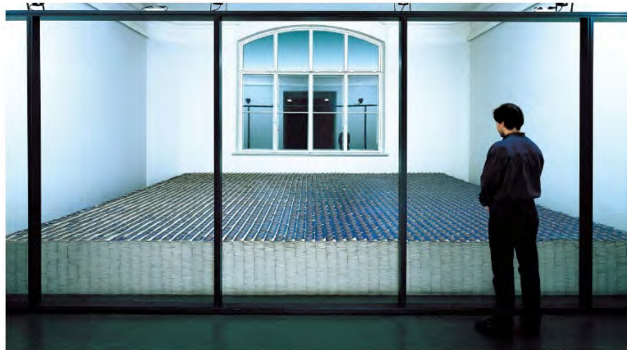
Below: Alfredo Jaar, One Million Finnish Passports, 1995 Museum of Contemporary Art, Helsinki