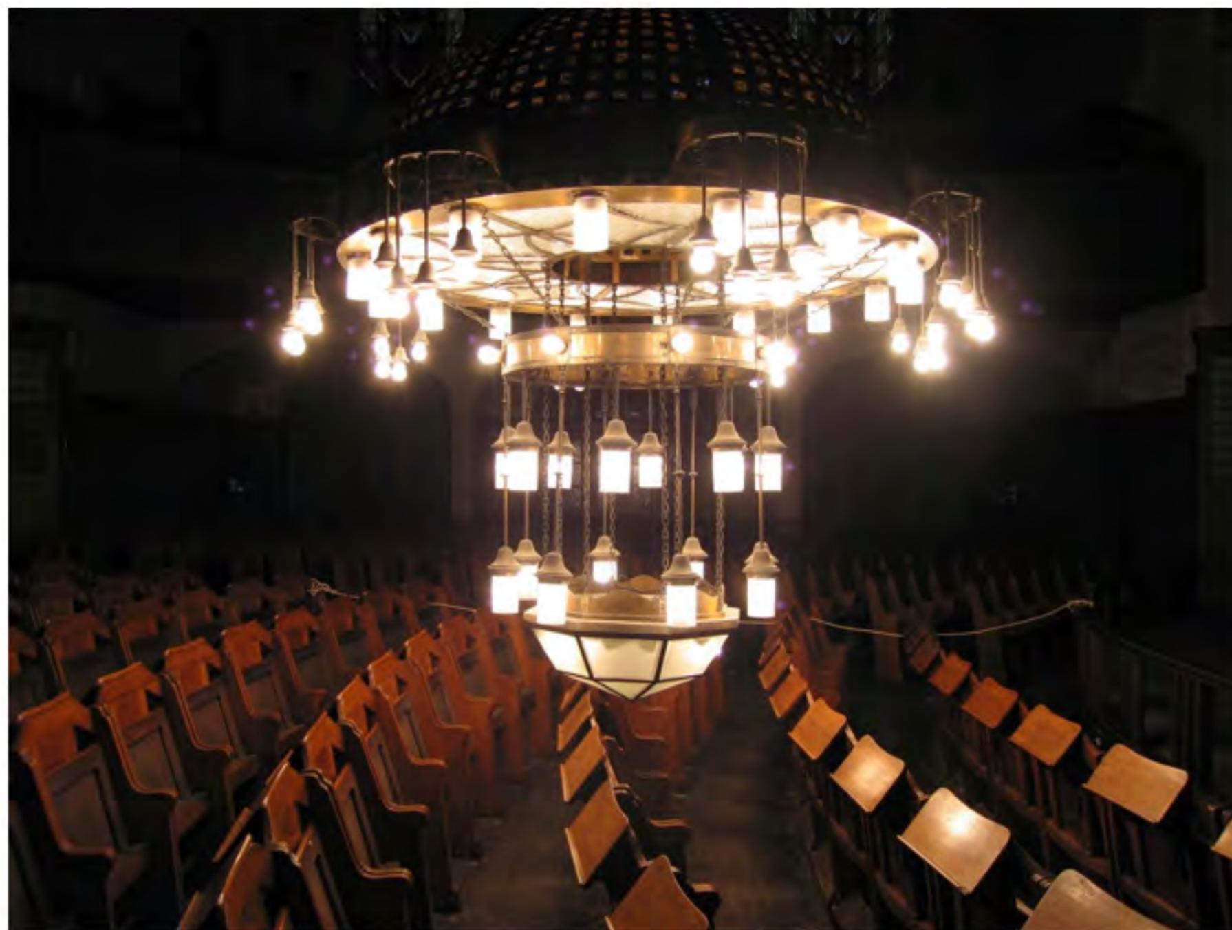
Above: Alfredo Jaar, Requiem for Leipzig, 2005 Leipzig, public intervention