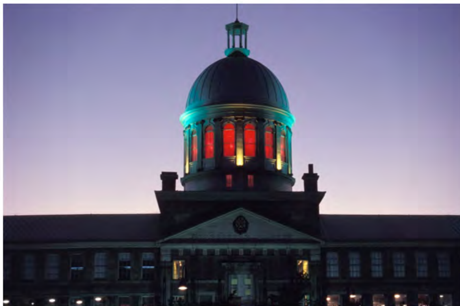
Below: Alfredo Jaar, Lights in the City, 1999 Bonsecours Market, Montréal Courtesy the artist, New York