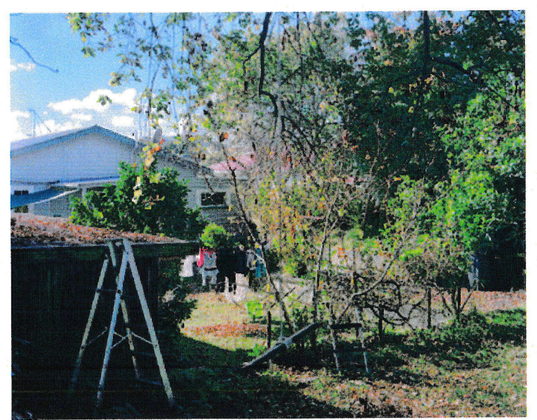
The Neighbors' Garden, 2012