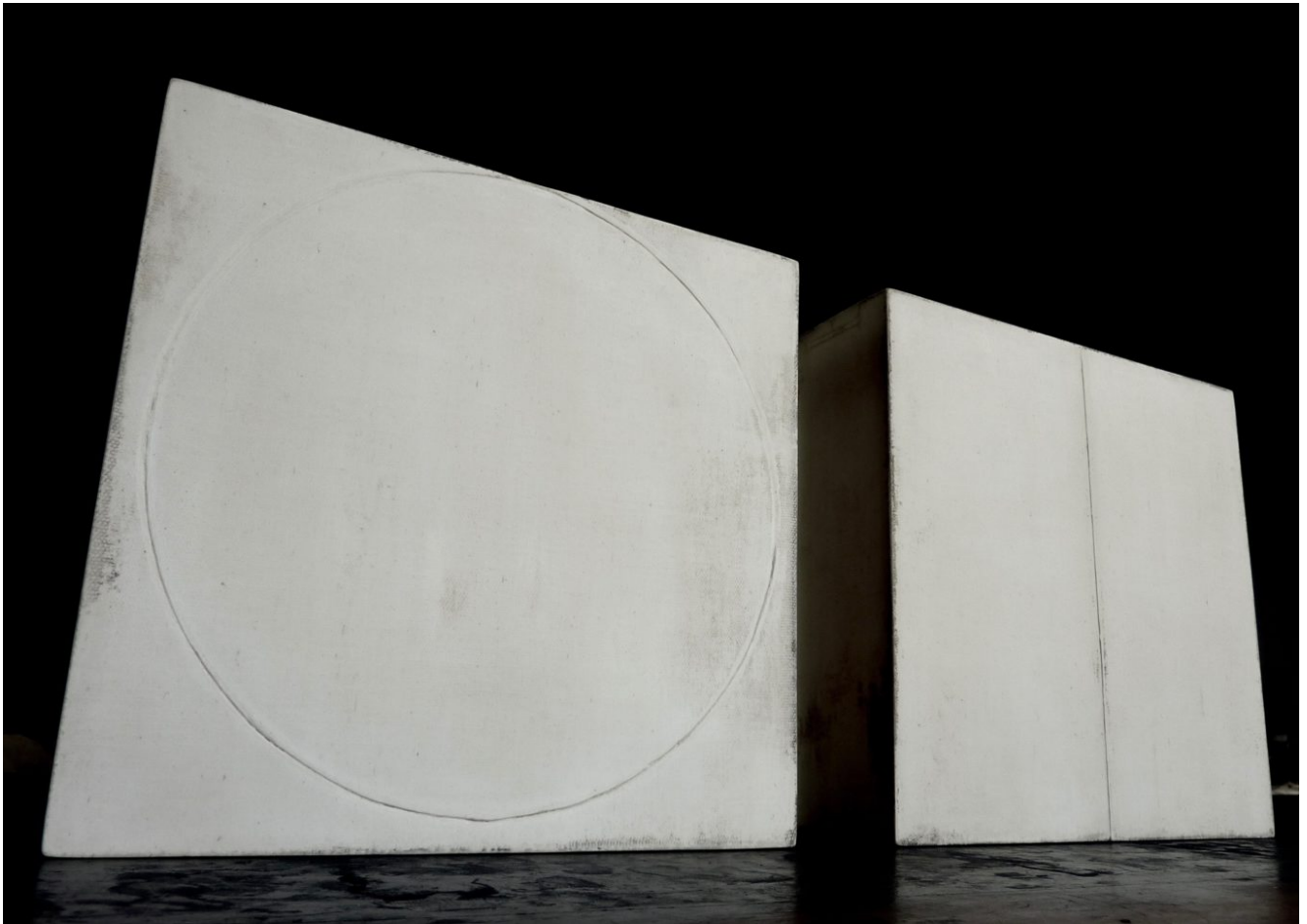
KAZU NAKAGAWA to weigh the fall of words I & II , 2015-16 timber, canvas, plaster, resin

T +64 9 379 9556 C +64 21 378 940 trish@trishclark.co.nz