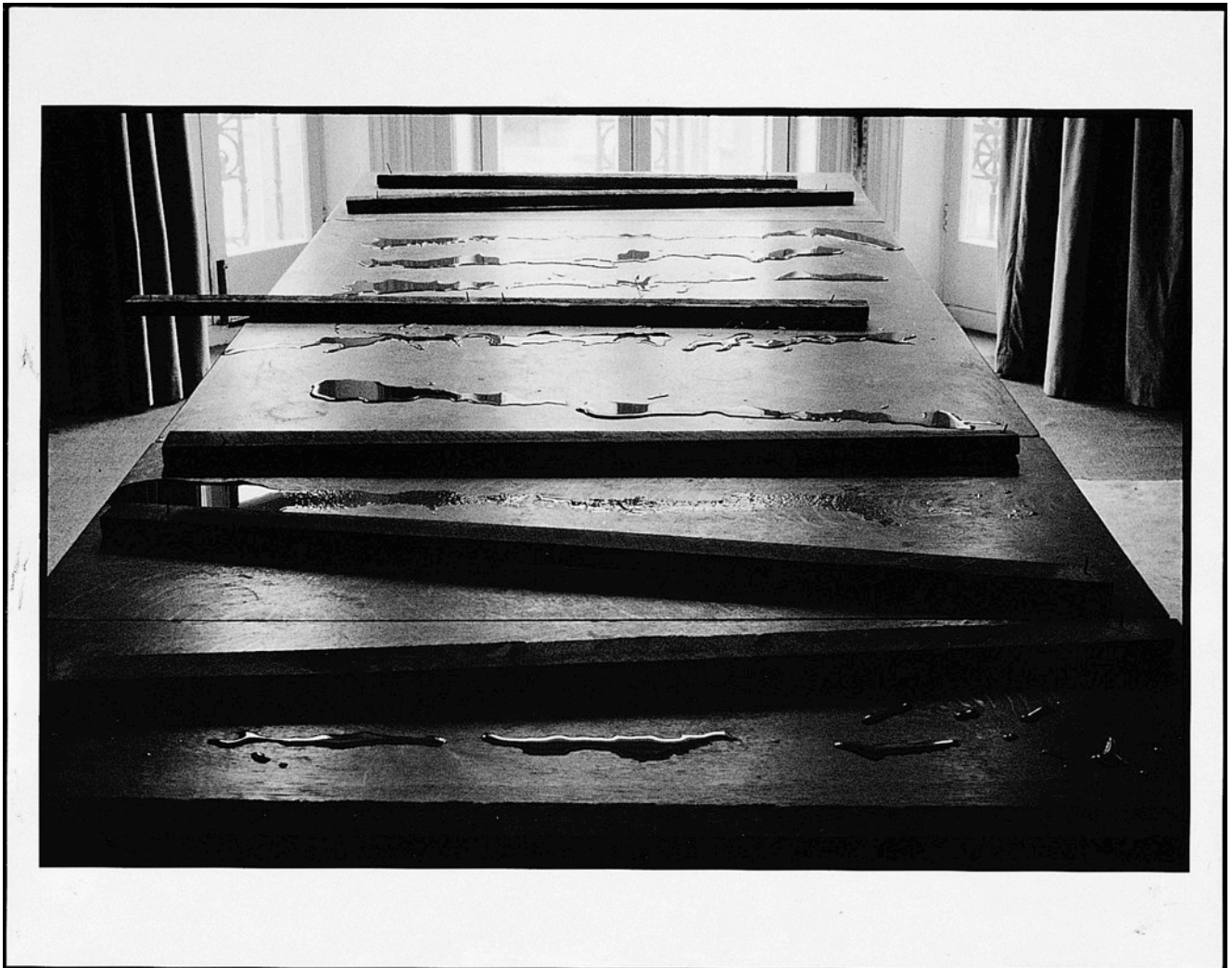
ANTHONY McCALL Water Table , 1972 set of 6 gelatin prints (detail) each 305 x 381mm