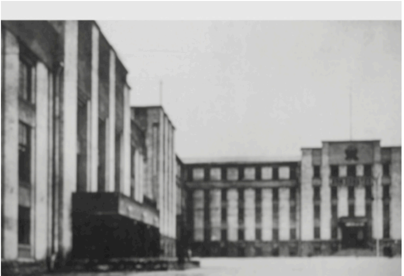
JENNIFER FRENCH Lied – from dream city , 2004 archival pigment print