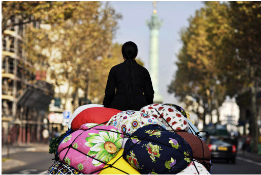
Bottari Truck – Migrateurs , 2007 Single channel video, 9:17 Edition 2/6 (+1 AP)