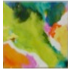
Cadmium Green, 2018 Acrylic, alkyd and oil on canvas 1600 x 1600 mm