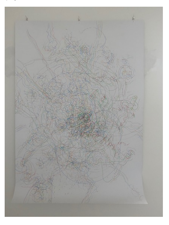
Sound Map Drawing, 2020 Pen on paper 715 x 1020 mm $800