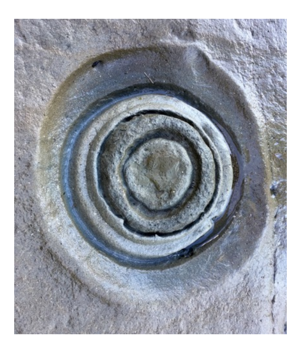
Am I Dreaming? , 2020 Video and sound Duration: 10:00 $3,800