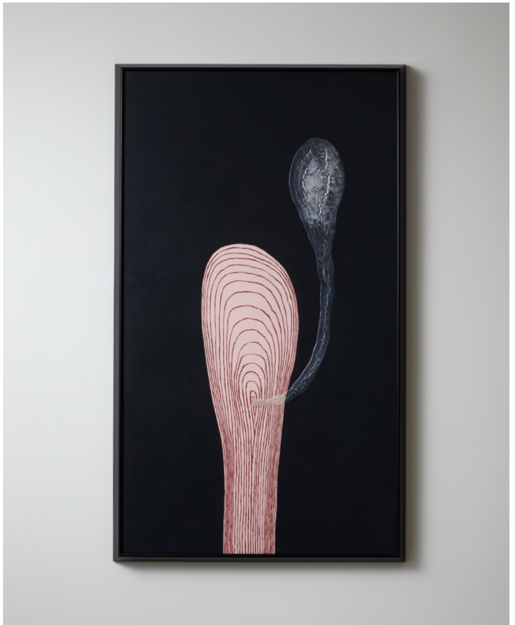
JULIA MORISON Abracadabra , 2019 Oil on canvas 2204 x 1250 mm $35,000