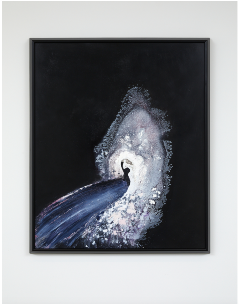
JULIA MORISON Spellbound 02, 2019 Oil on polyurethane board 1290 x 1080 mm $22,000