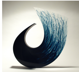
Crest, 2020 Cast bullseye glass, uniquely created hand drawn stringers, hand smoothed and polished 590 x 680 x 130 mm