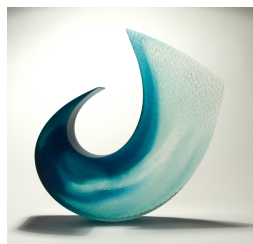
Floe 35, 2020 Cast gaffer jade and clear glass, hand smoothed, sandblasted and etched texture, polished 390 x 360 x 80 mm