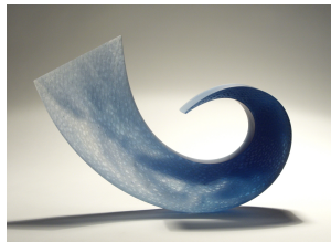
Floe 31, 2019 Cast steel blue and clear gaffer glass, ground, sandblasted texture, etched and hand smoothed 400 x 265 x 95 mm