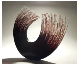
Drift, 2020 Cast bullseye glass, uniquely created hand drawn stringers, hand smoothed and polished 850 x 700 x 65 mm