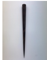
'artificial landscape #11', 2021 hand carved timber/Totara and its char height 1075mm $3,600