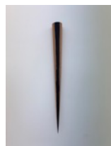
'artificial landscape #12', 2021 hand carved timber/Totara and its char height 800mm $3,600