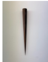
'artificial landscape #02' , 2021 hand carved timber/Totara and its char height 780mm $3,600