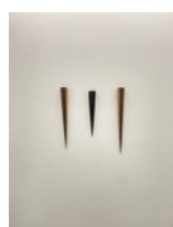
'artificial landscape #20' /Triptych, 2021 hand carved timber/Totara and its char 700 x 640mm $4,900