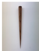
'artificial landscape #06' , 2021 hand carved timber/Totara and its char height 925mm $3,600