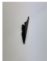
'artificial landscape', 2021 hand carved timber/Totara and its char height 350mm $2,200