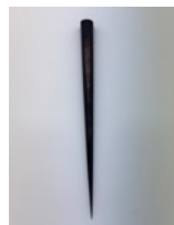
'artificial landscape #13', 2021 hand carved timber/Totara and its char height 1030mm $3,600