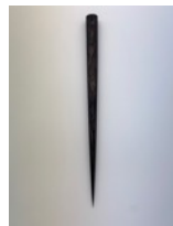
'artificial landscape #16', 2021 hand carved timber/Totara and its char height 1270mm $3,600