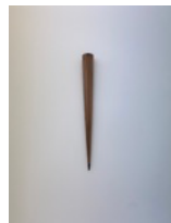
'artificial landscape #17', 2021 hand carved timber/Totara and its char height 755mm $3,600