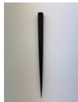
'artificial landscape #15', 2021 hand carved timber/Totara and its char height 1200mm $3,600