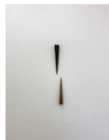
'artificial landscape #19' /Dptych, 2021 hand carved timber/Totara and its char 1060 x 175mm $3,900