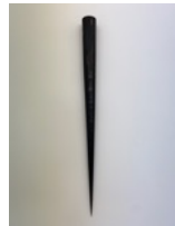
'artificial landscape #10', 2021 hand carved timber/Totara and its char height 1080mm $3,600