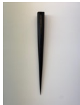
'artificial landscape #01' , 2021 hand carved timber/Totara and its char height 800mm $3,600