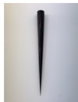
'artificial landscape #05' , 2021 hand carved timber/Totara and its char height 890mm $3,600