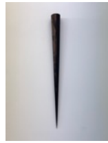
'artificial landscape #07', 2021 hand carved timber/Totara and its char height 955mm $3,600