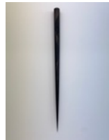
'artificial landscape #18', 2021 hand carved timber/Totara and its char height 1655mm $4,600