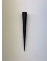
'artificial landscape #08', 2021 hand carved timber/Totara and its char height 625mm $3,600