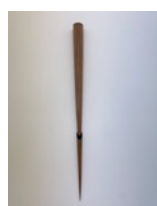
'artificial landscape #14', 2021 hand carved timber/Totara and its char height 1230mm $3,600