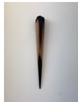
'artificial landscape #00' , 2021 hand carved timber/Totara and its char height 575mm $3,600