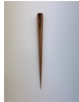
'artificial landscape #09', 2021 hand carved timber/Totara and its char height 870mm $3,600