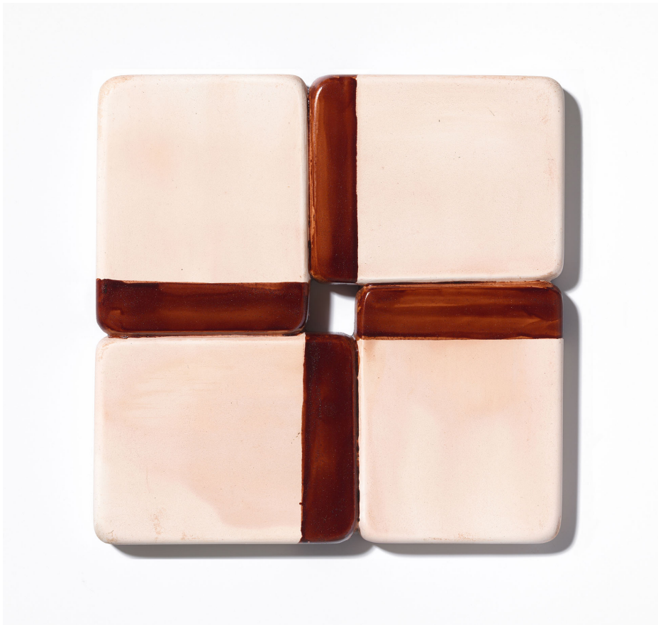
Quadruplet Pivots B , 2022 acrylic and dragon's blood on PVC board