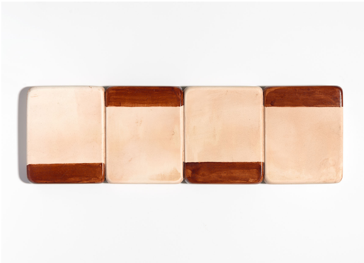
Quadruplet Pivots G, 2022 acrylic and dragon's blood on PVC board