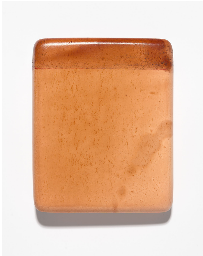
Pivot 1, 2022 acrylic and dragon's blood on PVC board