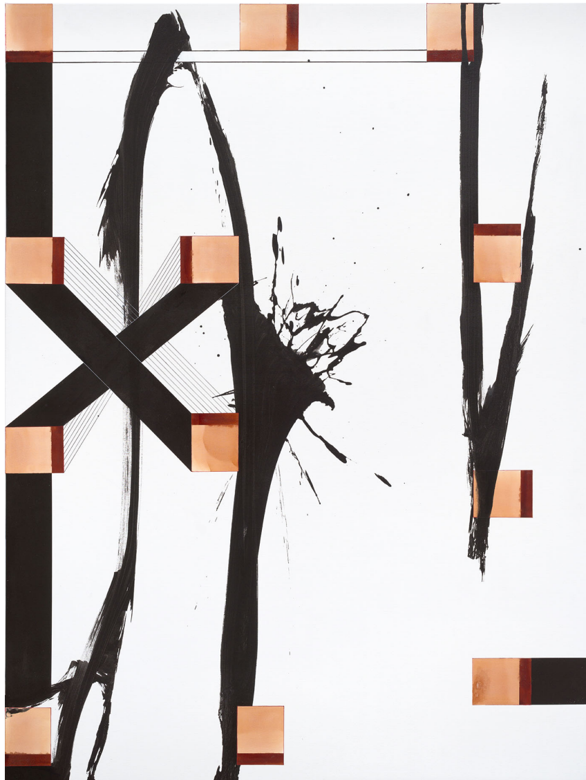
Segue 10, 2022 Acrylic, dragon's blood and shellac on linen 2000 x 1500 mm