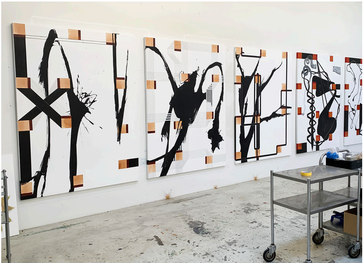
Studio view, 2022