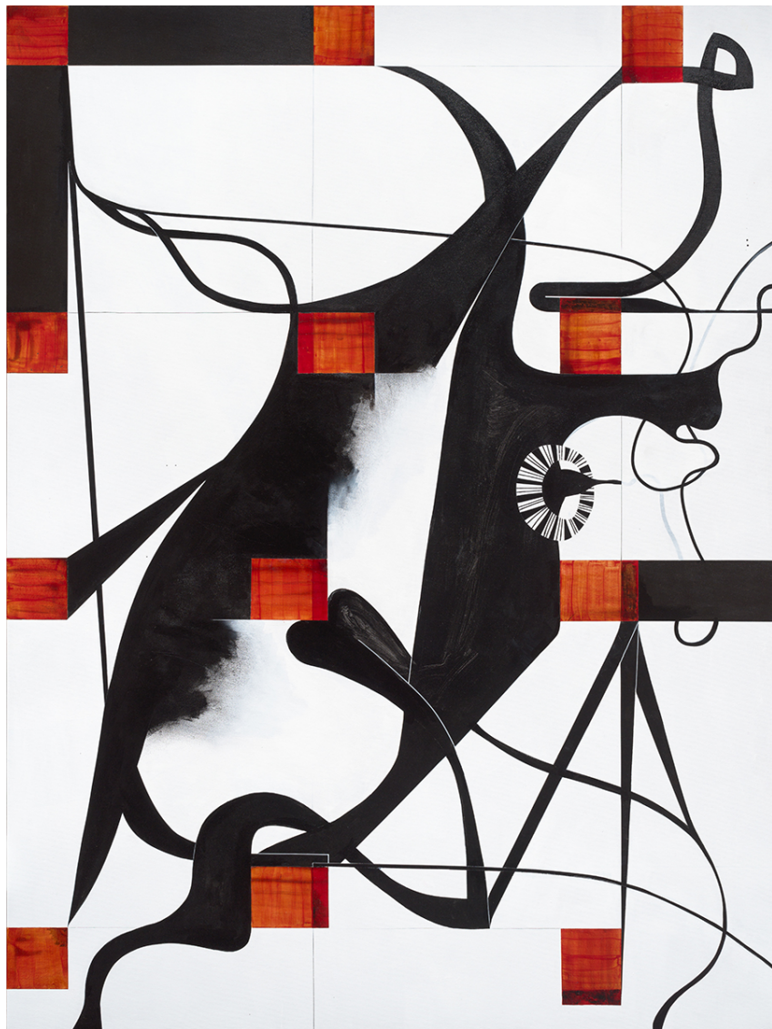
Segue 05, 2020 Acrylic, dragon's blood and shellac on canvas 2000 x 1500 mm