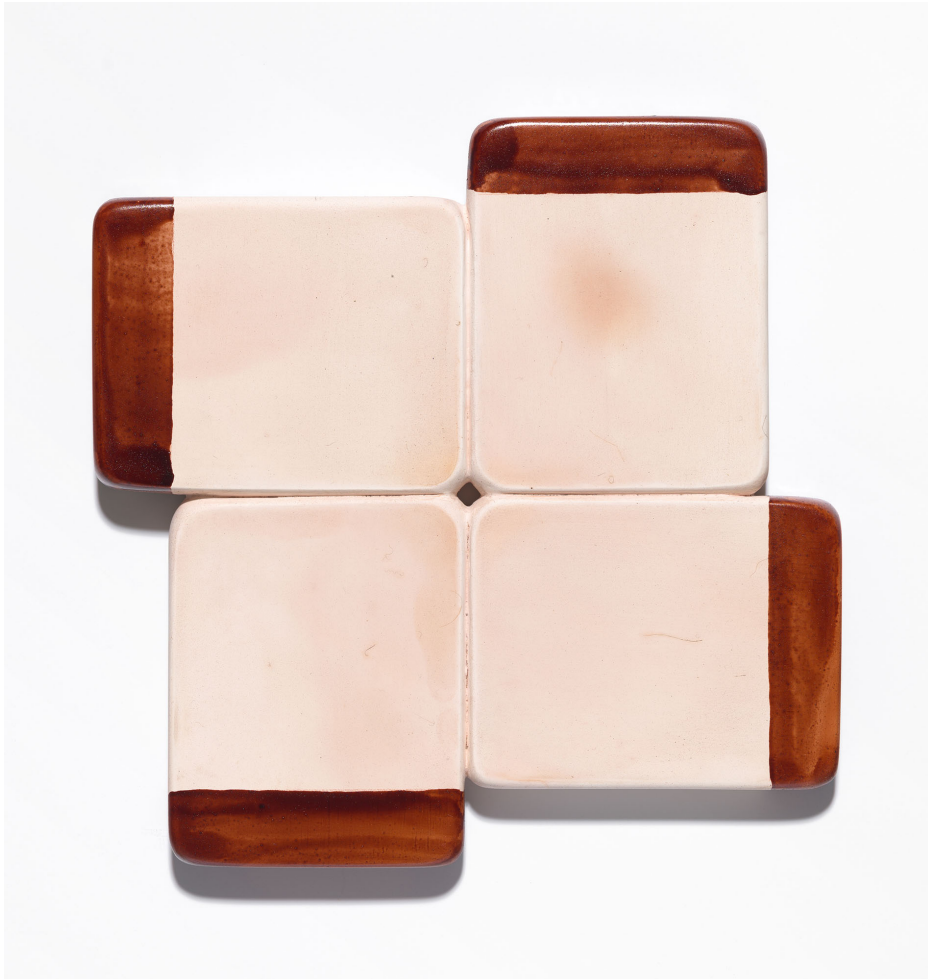
Quadruplet Pivots C, 2022 acrylic and dragon's blood on PVC board