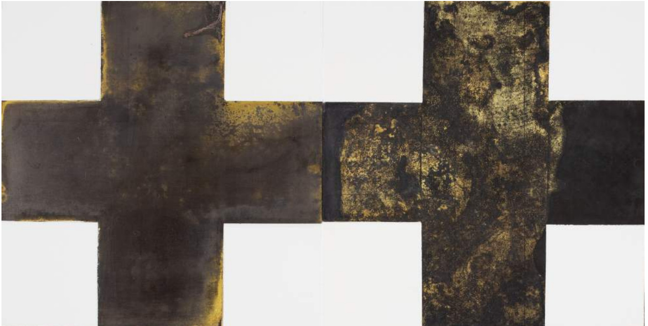
Twenty Thirty (IX) (NIGHT/DAY), 2023 Lacquer & chemical action on two copper panels on ply 170 x 340 mm