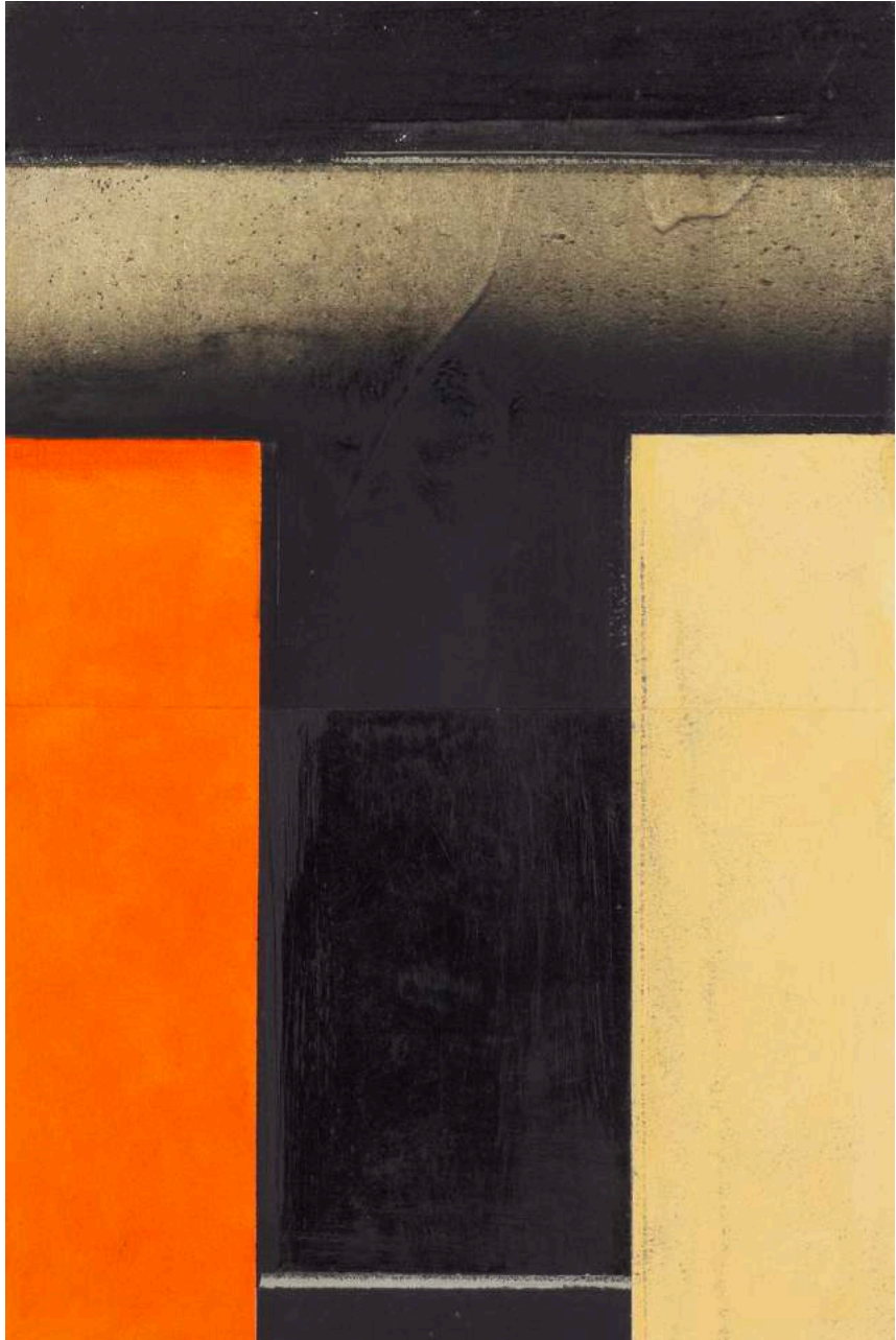
The Turning of the Bones , 2019 Acrylic and 24k gold leaf on three aluminium panels on plywood 170 x 255 mm