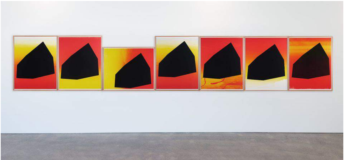
World Still Turning (a work in seven parts) (1/3), 2008/2022 Seven framed inkjet prints on Hahnemuhle 300gsm photorag paper 840 x 7968 mm