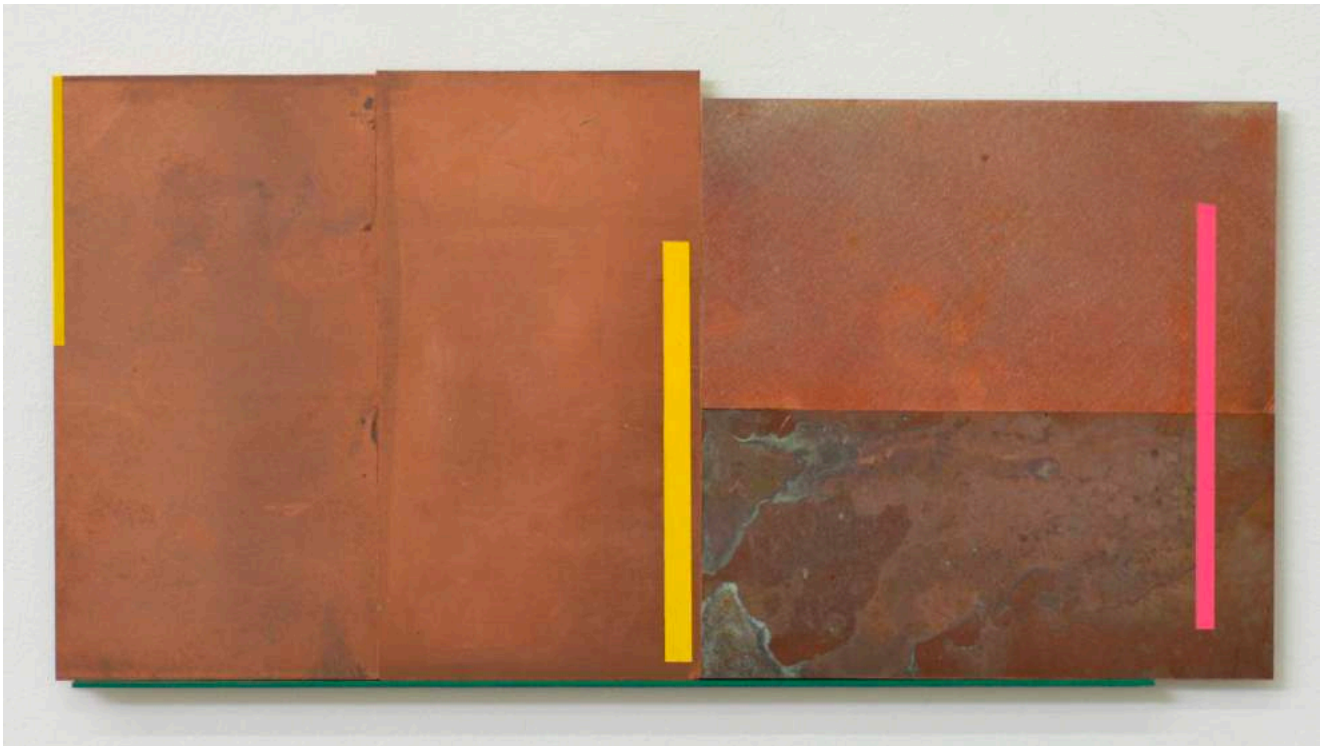
Sight Line (XXXI) , 2024 Chemical action and acrylic on four copper panels and aluminium extrusion 183 x 360 mm