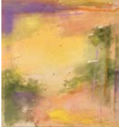
Floor Painting #14, 2024 Acrylic, flashe, spray-paint and oil on raw canvas 1310 x 1250 mm $13,000