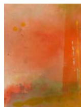
Floor Painting #15, 2024 850 x 650 mm Acrylic, flashe, spray paint on raw canvas $6,500