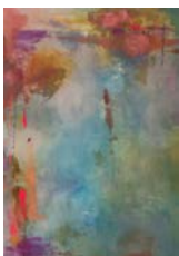
Floor Painting #10, 2024 2300 x 1600 mm Acrylic, flashe, spray paint and oil on raw canvas $20,000