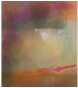
Floor Painting #9, 2024 Acrylic and flashe on raw canvas 850 x 750 mm $7,500