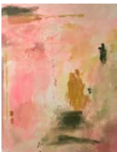
Floor Painting #6, 2024 Acrylic and flashe on raw canvas 1980 x 1520 mm $18,000