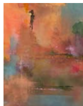
Floor Painting #7, 2024 Acrylic, flashe, spray-paint and oil on raw canvas 1600 x 1250 mm $15,000