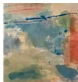
Floor Painting #16, 2024 1350 x 1300 mm Acrylic, flashe and spray paint on raw canvas $13,000