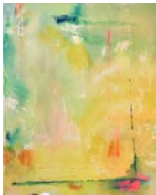
Floor Painting #5, 2024 Acrylic, flashe, spray-paint and oil on raw canvas 2100 x 1700 mm $20,000