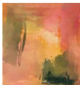
Floor Painting #12, 2024 Acrylic, flashe, spray-paint and oil on raw canvas 900 x 850 mm $7,500