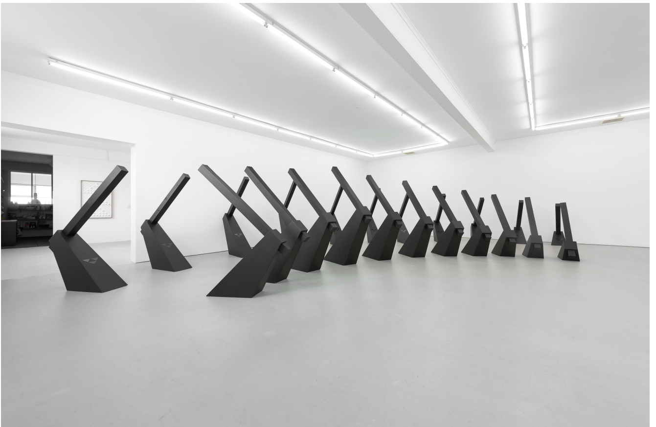
Te Haehaenga o Pekehāua, 2024