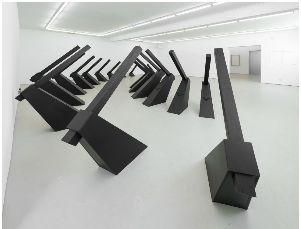
Te Haehaenga o Pekehāua, 2024 Installation views