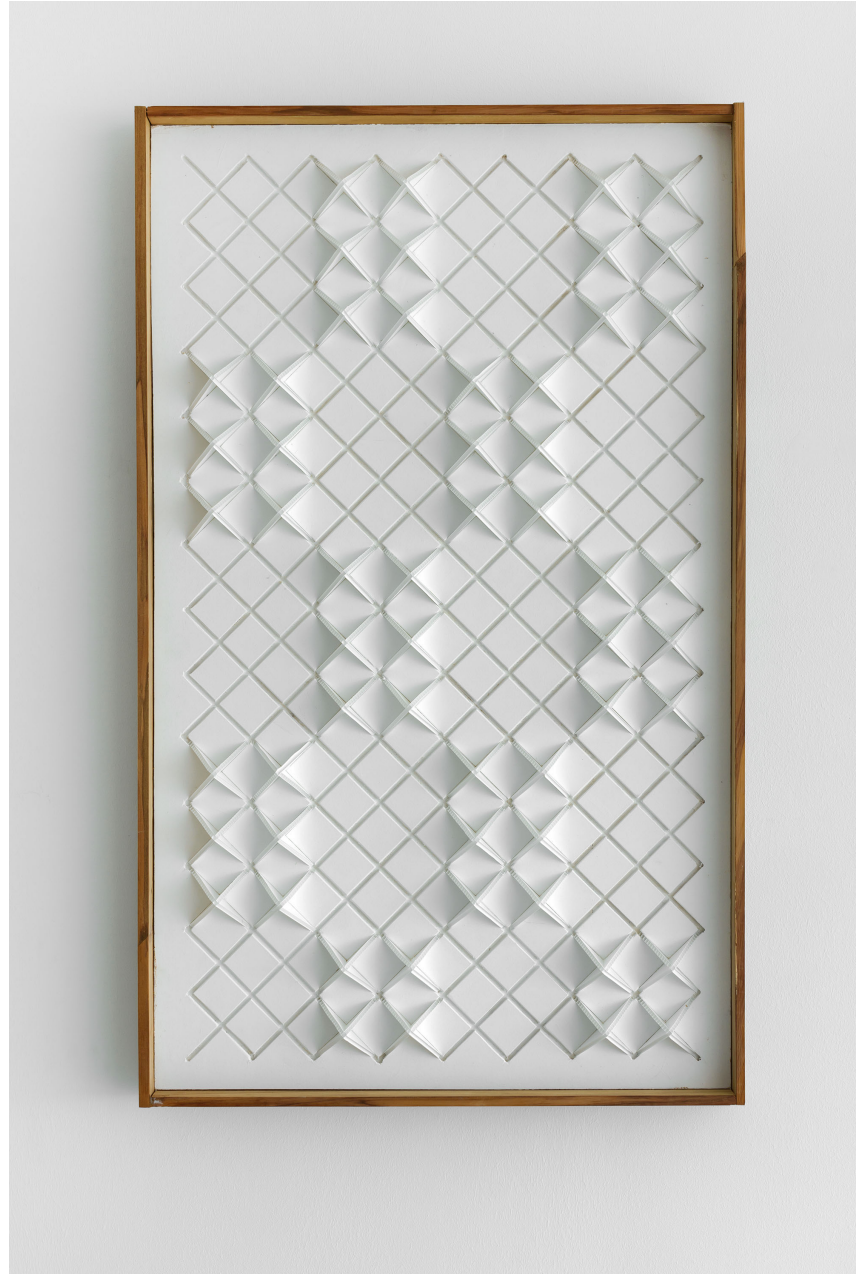
Roimata tahi , 2024